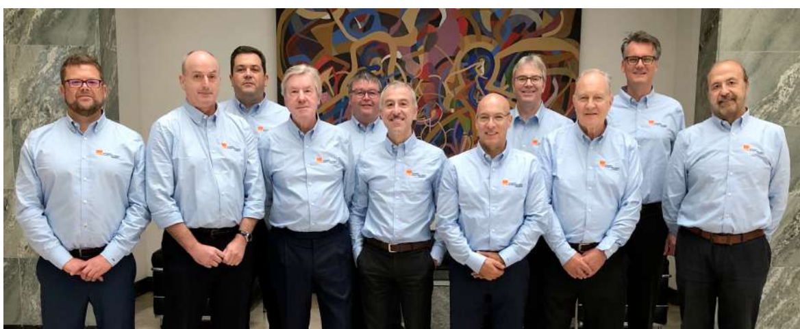
The EICF Board of Directors at their meeting in Porto, 22 of November 2017, where Strategic Plan was reviewed.

The EICF is about members and to provide value to members. During 2017 the EICF Board of Directors have been working in building up a new Strategic Plan to be implemented within the next 4 years to provide the transformation and enhancement of the value proposition offered to members and stakeholders. Early manifestation of this revised strategy is the new corporate image and the new web site to be online by year end.