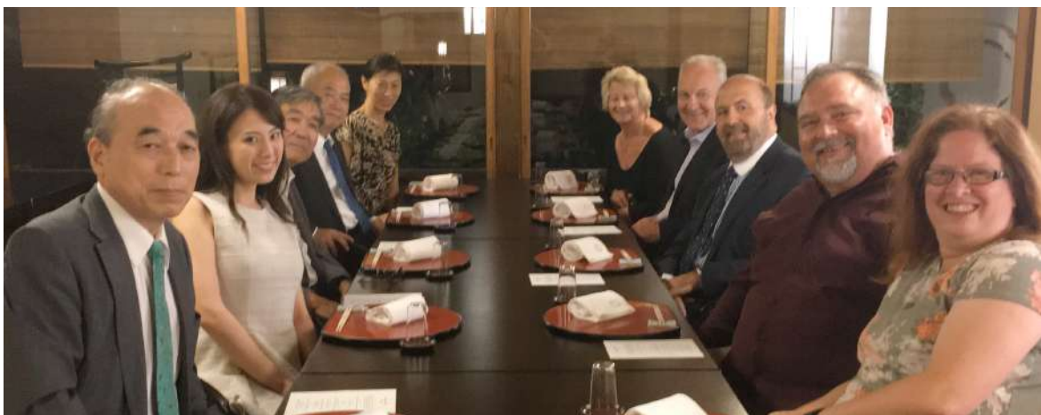
JFS, ICI and EICF representatives at a dinner in Tokyo Sep 2017

JFS, ICI and EICF organize every 4 years the World Conference on Investment Casting WCIC. Next WCIC shall be the 15th World Conference on Investment Casting & Equipment Expo to be celebrated in October 18 - 21, 2020, at the Disneyland Hotel Anaheim, CA, USA.