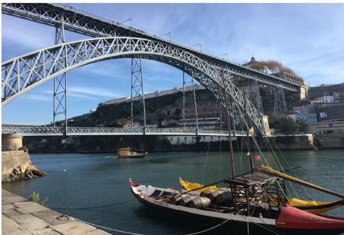
The Dom Luís I Bridge by Théophile Seyrig, a disciple of Gustave Eiffel

One of Portugal's internationally famous exports, port wine, is named after Porto, since the metropolitan area, and in particular the cellars of Vila Nova de Gaia, were responsible for the packaging, transport and export of the fortified wine. In 2014 and 2017, Porto was elected The Best European Destination by the Best European Destinations Agency.